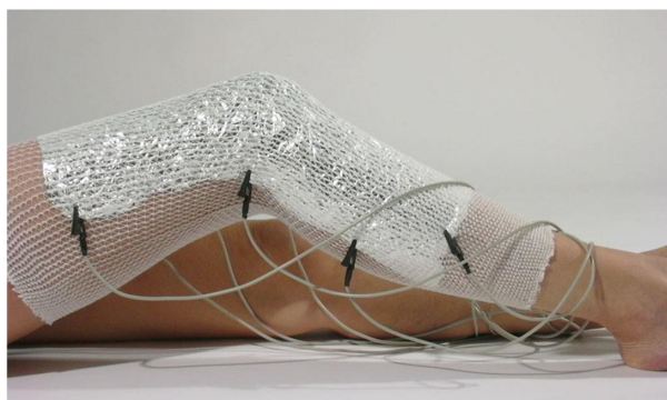
Figure 1 REAC Tissue Optimization (REAC-TO) protocol consisting of one hundred radiofrequency 2.4 GHz bursts of 0.5 seconds spaced with 4.5 seconds pause, applied by a special laminar aluminum probe on the skin to treat.

A 70-year-old woman was treated with oral anticoagulants after an accidental fall while descending a flight of stairs. The fall resulted in a significant hematoma, with hemorrhagic suffusion present in the buttocks (Figure 2) and inguinal canal (Figure 3), resulting in significant pain in the traumatized areas. Immediately following the trauma, the subject started treatment with REAC-TO. Two sessions were performed per day, one hour apart, for six days. No other therapy was locally applied while REAC-TO treatments were being conducted. Following the first session, a rapid improvement was observed in the subject's condition, and in her level of pain. As a result, an almost full recovery was achieved within six days (Figures 4 and 5).