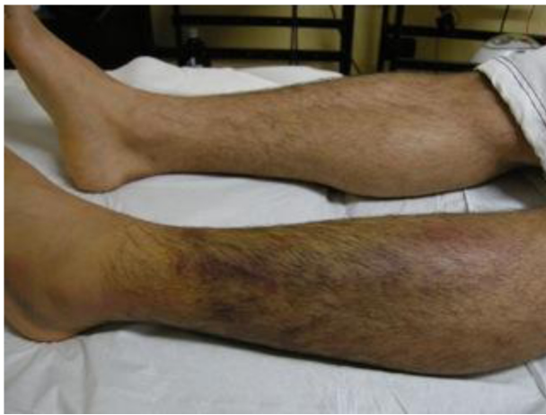
Figure 20 Male 28 years old, hit by a car. Before REAC-TO treatment.

a rapid-acting analgesic. REAC-TO treatments were also associated with antiedematous, anti-inflammatory, and regenerative 17 effects.