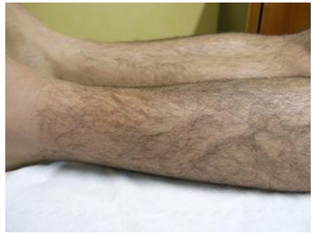
Figure 22 Male 28 years old, hit by a car. Images taken at follow-up done after 14 days from the end of treatment course, with 18 REAC-TO sessions performed in nine days.

The cases and results presented in this study are representative of those achieved in our clinics with the application of REAC-TO to post-traumatic injuries. REAC-TO has shown