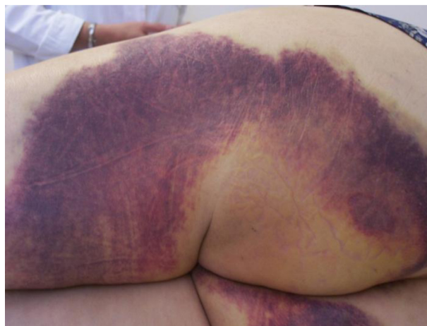
Figure 2 Female 70 years old, treated with oral anticoagulants, accidental fall while descending the stairs. Before REAC-TO treatment.