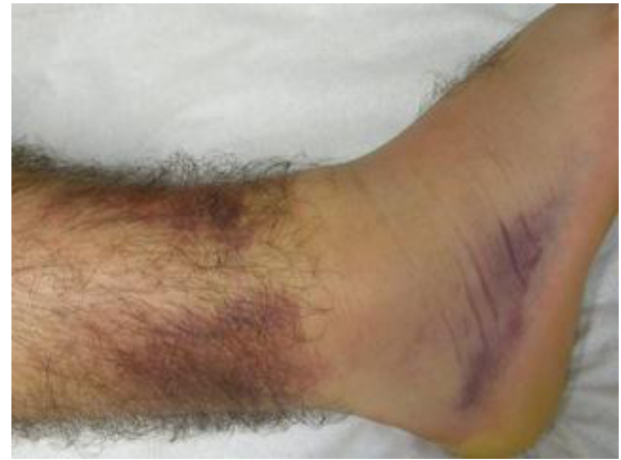
Figure 14 Male 18 years old, accidentally fell on the steps of a staircase. Before REAC-TO treatment.