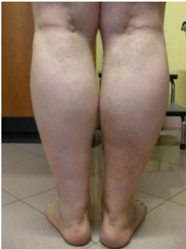
Figure 13 Male 30 years old, crushing accidental trauma on right leg. After 18 REAC-TO treatment in three weeks.

immediately following the trauma, with two sessions conducted daily for 12 days. Following the first treatment, a significant reduction in pain and functional recovery were reported. During REAC-TO treatments, the subject also did not receive any other local therapies. After 12 days, complete functional recovery of the tibiotalar joint was achieved, and the ecchymotic suffusion was resolved (Figures 16 and 17).