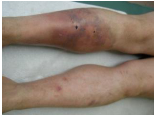
Figure 10 Male 30 years old, crushing accidental trauma on right leg. Before REAC-TO treatment.

treatment, a significant decrease in pain and functional recovery was reported, eliminating the need for painkillers. While REAC-TO treatments were underway, no additional local therapy was applied. Following completion of the REAC-TO treatments, modest local edema and slight discoloration from hemosiderin deposition remained (Figures 12 and 13). However, total recovery of limb function was achieved.