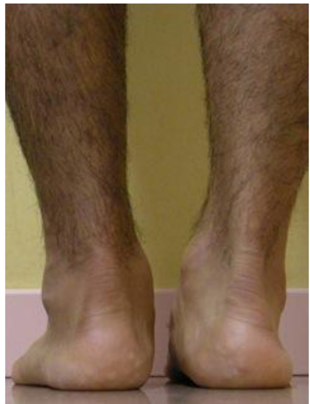
Figure 23 Male 28 years old, hit by a car. Images taken at follow-up done after 14 days from the end of treatment course, with 18 REAC-TO sessions performed in nine days.