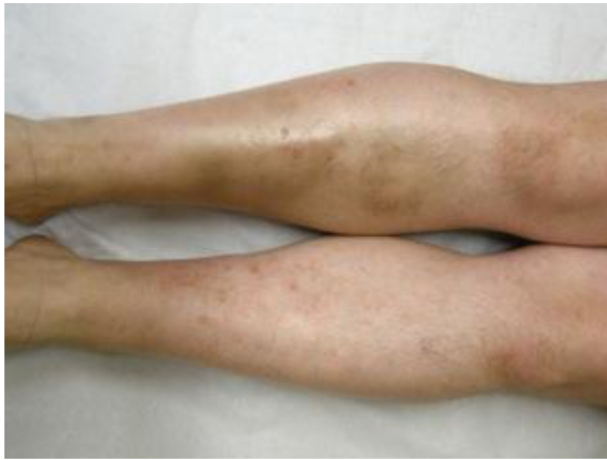
Figure 12 Male 30 years old, crushing accidental trauma on right leg. After 18 REAC-TO treatment in three weeks.