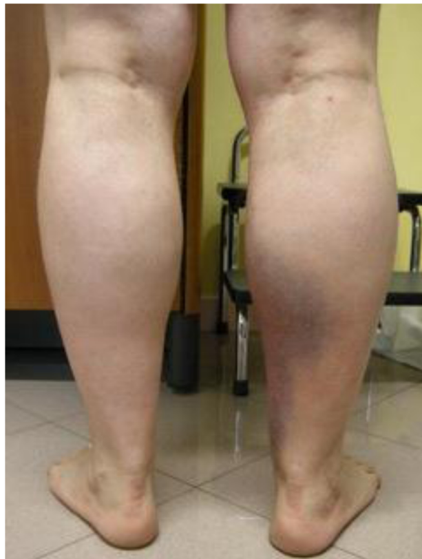
Figure 11 Male 30 years old, crushing accidental trauma on right leg. Before REAC-TO treatment.