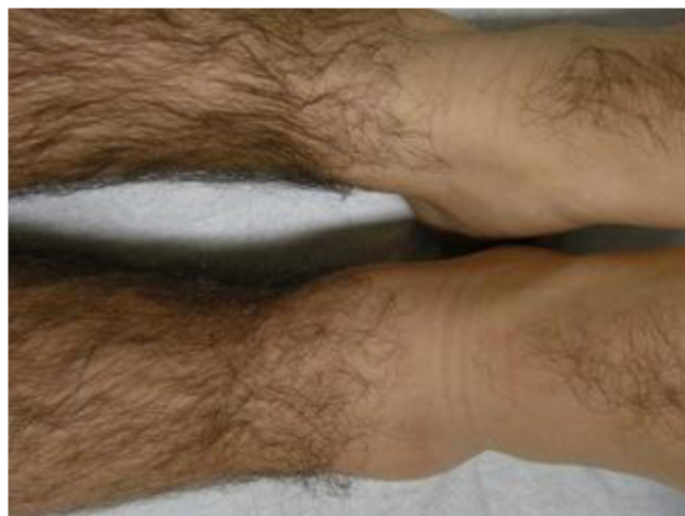
Figure 17 Male 18 years old, accidentally fell on the steps of a staircase. Images taken at follow-up done after 12 days from the end of treatment course, with 12 REAC-TO sessions performed in six days.