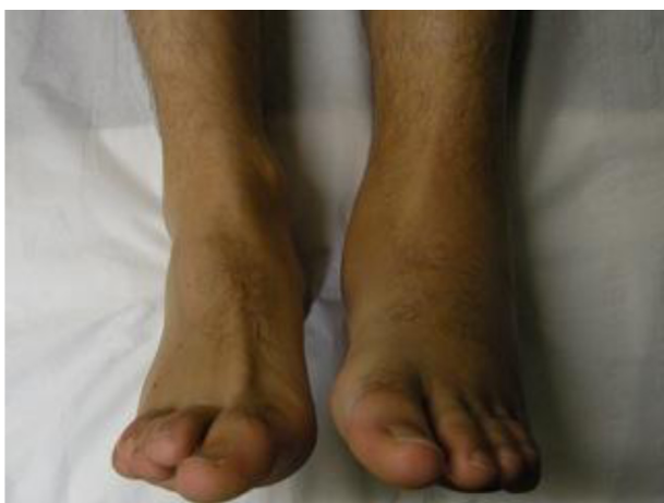
Figure 18 Male 35 years old, accidental fall from a ladder. Before REAC-TO treatment.

a total of 18 sessions. Following completion of the first treatment, a significant reduction in pain was reported, and sufficient functional recovery was achieved to enable the patient to walk. The patient did not require further treatment with painkillers. Thirty days after the start of treatment, complete functional recovery of the tibiotarsal joint was demonstrated, and resolution of the hematoma in the heel was achieved. Recovery of salient bone features in the joint was also observed (Figure 19).