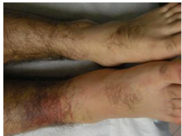
Figure 15 Male 18 years old, accidentally fell on the steps of a staircase. Before REAC-TO treatment.

A 35-year-old man accidentally fell from a ladder, resulting in a conspicuous ecchymotic suffusion that affected the tibiotalar joint, and was associated with a hematoma in the heel (Figure 18). Severe pain and loss of function in the traumatized limb were reported by the subject. REAC-TO treatments were started immediately, with two sessions conducted daily for